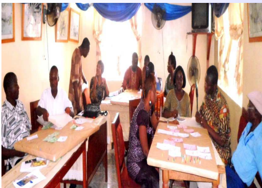
TISL Staff strategically planning for the next five (5) years to fight both the public and Private Sectors and NGO's of Corruption in Sierra Leone

A three day Strategic Planning exercise was conducted by TISL in order to produce a five (5) year Strategic plan for it operations. The planning put into perspective the direction TISL will take in the next five years in its fight against corruption; embracing fully the public and private sectors, civil society and the citizenry of Sierra Leone.